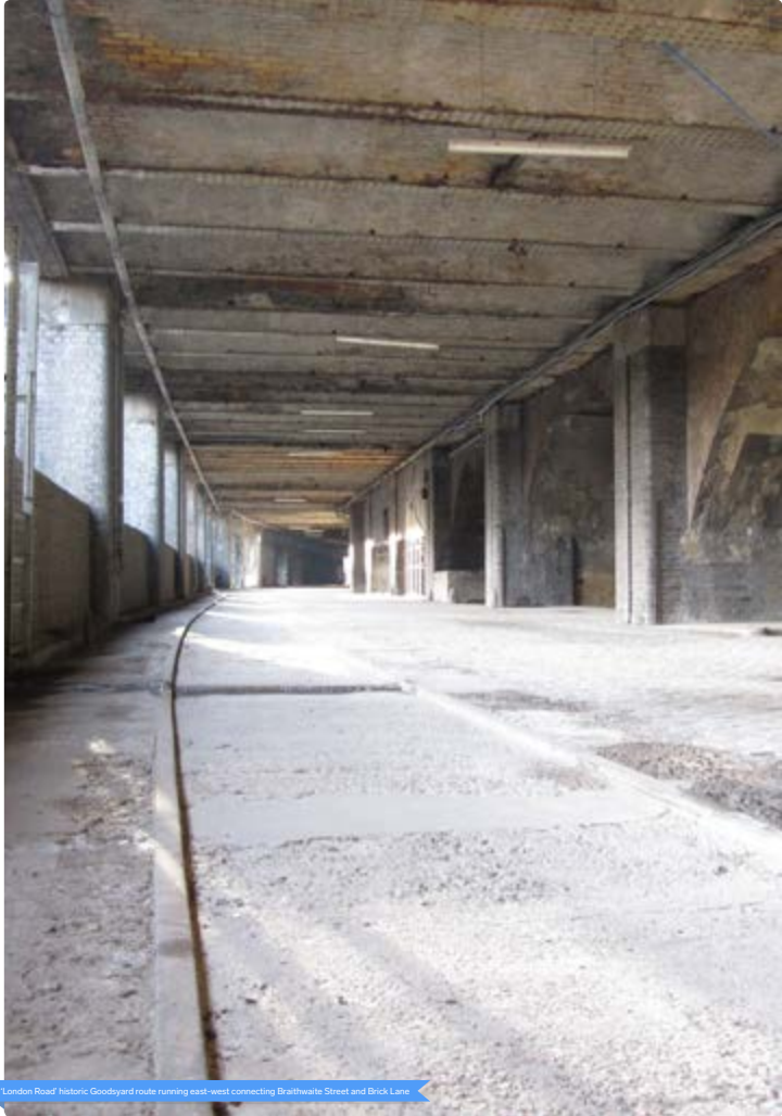
London Road historic Goodsyard route running east-west connecting Braithwaite Street and Brick Lane